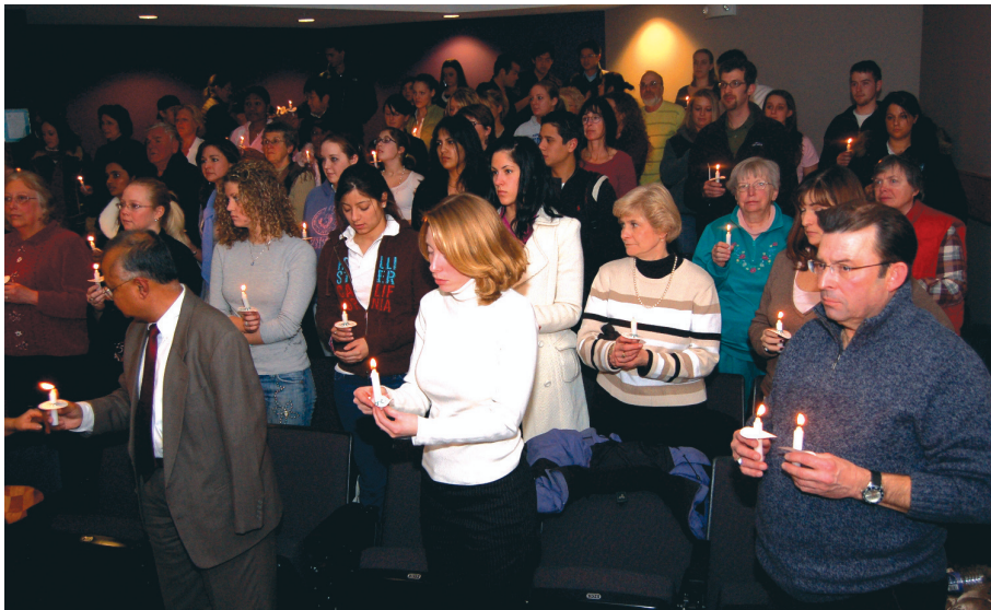
A crowded Walker Auditorium in silence during a moment of remembrance.